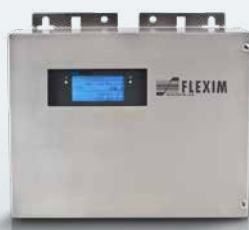
FLUXUS® G722 ST-HT Stainless Steel