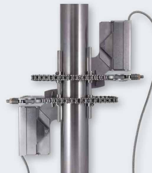
High-temperature mounting system - WaveInjector®