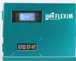
FLUXUS® G722 ST-HT

More than 30 years of experience in non-invasive ultrasonic flow measurement