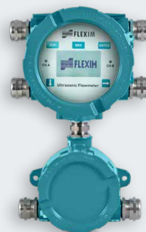
High Temperature Steam Meter G831 ST-HT for hazardous environments