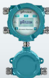
FLUXUS® G831 ST-HT