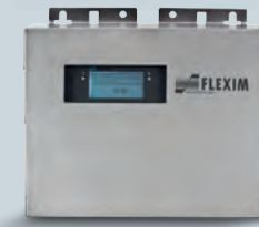
FLUXUS® F/G722 Stainless Steel

FLEXIM AMERICAS Corporation Headquarters 250-V Executive Drive Edgewood, NY 11717 Phone: (631) 492-2300