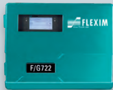
FLUXUS® F/G722 Aluminium

For more detailed Information please download the Technical Specifications here: www.flexim.com .